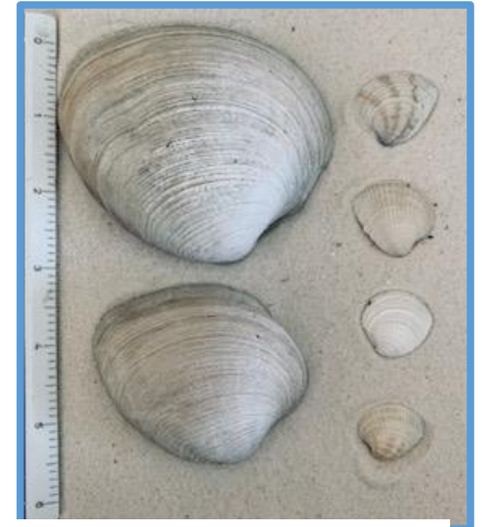
F - Clam