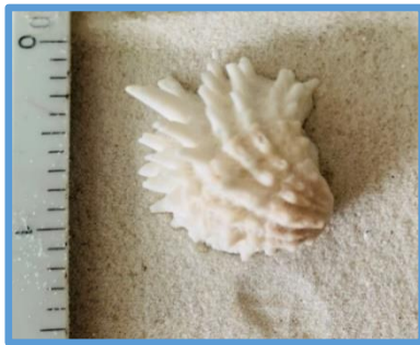
L - Spiny Jewel Box