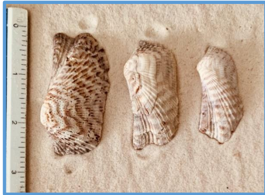
J - Turkey Wing