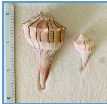
N - Whelk