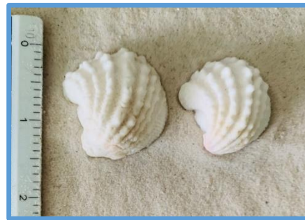
M - Kitten's Paw