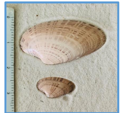
I - Sunray Venus