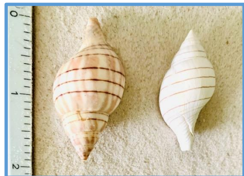
R - Tulip