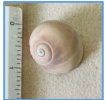
P - Shark's Eye