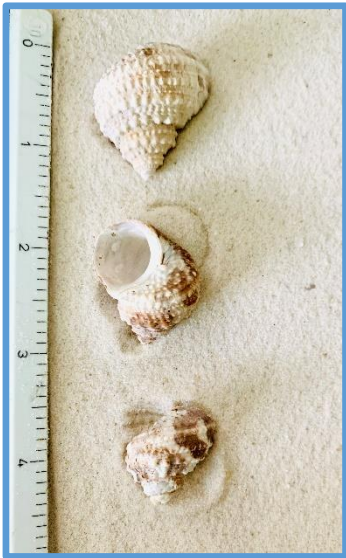
D - Turban