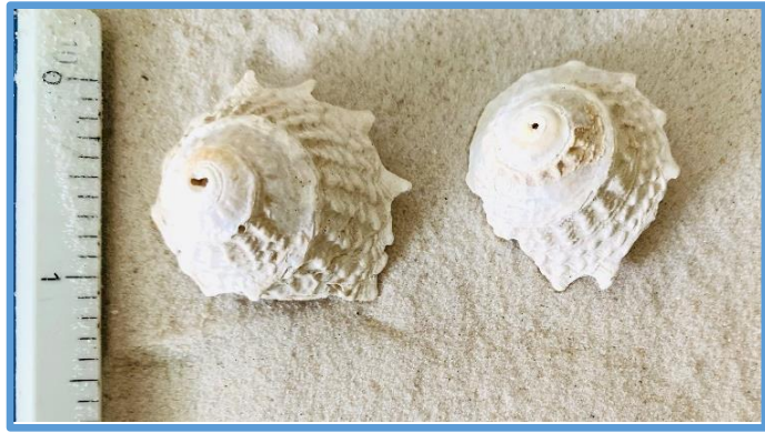
K - Long Spined Star