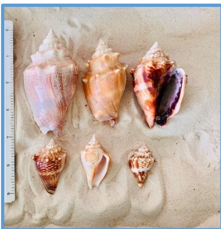
G - Conch