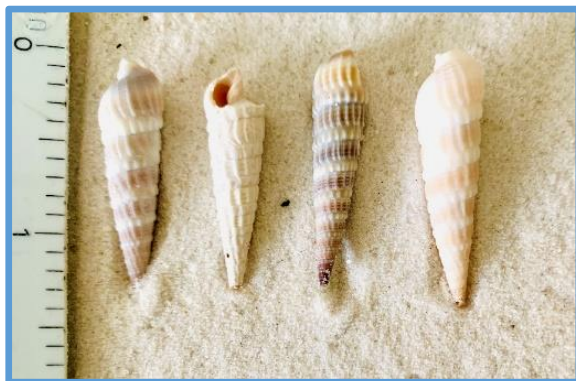
Q - Auger