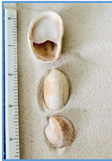
B - Slipper