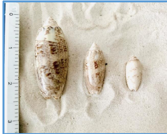
E - Olive