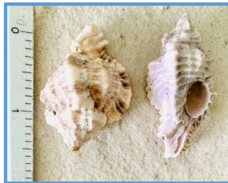
O - Murex